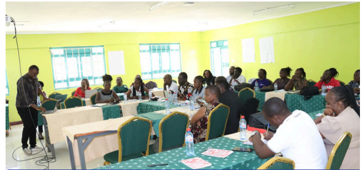
Nurses, and health care service providers from Khaunga and ACK Namasoli Health Facilities undergoing training in Emergency Obstetric and Newborn Care (EmONC) at the ACK Diocese in Mumias, Kakamega County.