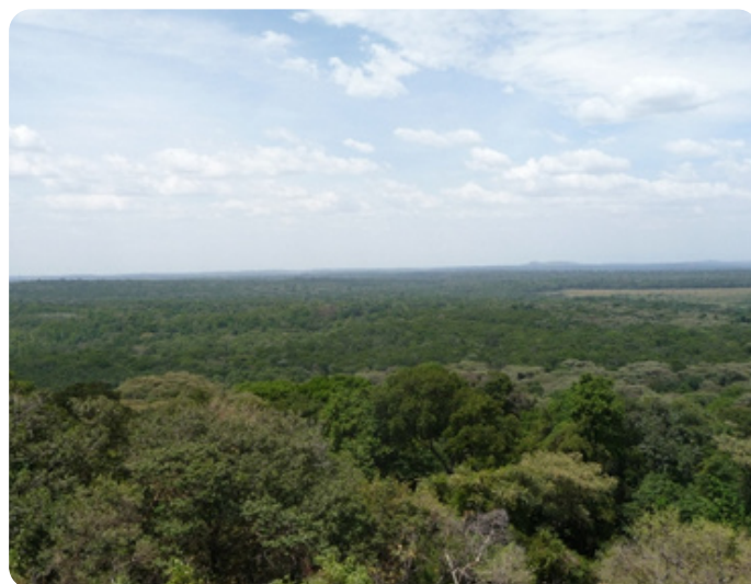
Photo: Section of Kakamega Rain Forest

With climate change bringing erratic rainfall patterns, droughts, and floods, rural communities in Western Kenya are particularly vulnerable.